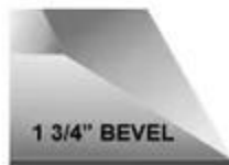
1 3/4" BEVEL

Beveled Edge – A Bevel is an angle on the top of the glass around the perimeter to produce an elegant look. It can be done on glass from 1/8 – 3/4" thick. The bevel range is from 1/2" – 1 3/4" wide. This edgework cannot be done in shop and is a special order.