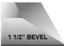
1 1/2" BEVEL