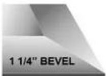
1 1/4" BEVEL